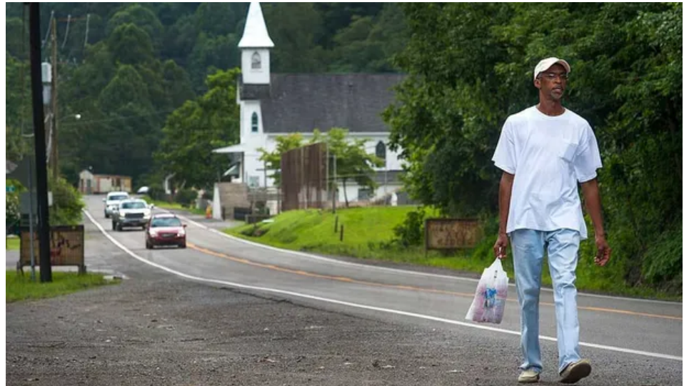
McDowell County in West Virginia: where the streets have no name

look at the titles it has chosen for its roads, alleys and boulevards. It's an approach that one group of researchers is now calling "streetonomics" – and it promises to uncover previously hidden insights about the societies we live within.