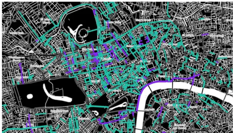
...whereas in London, streets named after people are 60% male and 40% female

Other trends that the streetonomics team observed included changes in the types of professions venerated. Certain jobs have been consistently celebrated over the centuries, such as artists and writers – particularly so in Paris and Vienna – but others have gone out of fashion, such as military leaders. In recent decades, London has begun to name more streets after people in the creative sector than one its previous favourite sources: the Royal Family. And in New York, most of the named streets come from the "business and community" sector, such as civil servants, or emergency responders involved in the 2001 attacks.