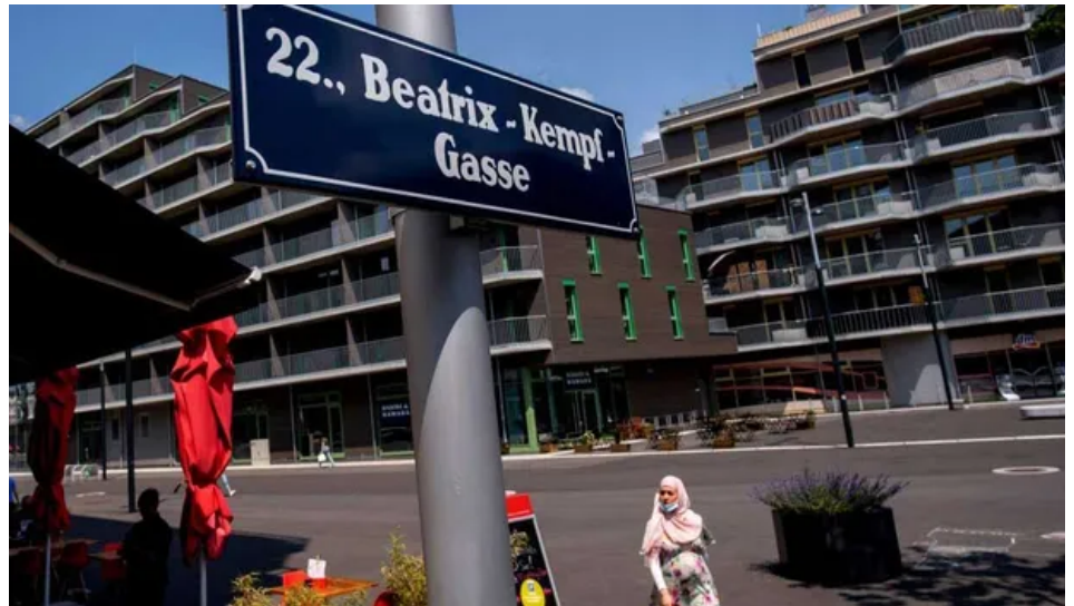
A street in a suburb of Vienna, one of the cities that the "streetonomics" team studied

inspiration came from some of their previous work, which BBC Future first covered back in 2013 , where they attempted to measure aspects of a city not captured by the usual economic indicators, such as how people attach emotions and memories to certain places. They were also inspired by the study of " culturomics ", which attempts to study previously unquantifiable facets of human culture.