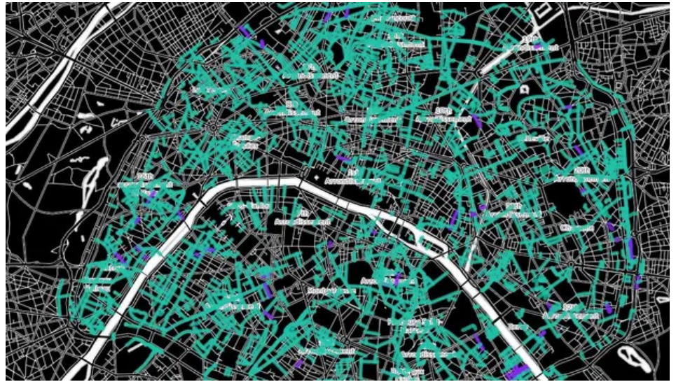
Of person-titled streets in Paris, male names (green) are more common than female (purple)